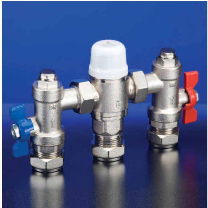
Fig 78 TMV 3